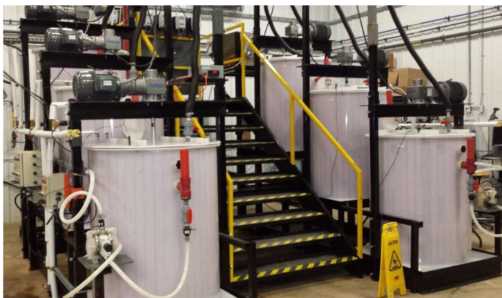
Search Water Leach Pilot Plant at SGS

Search Minerals completed a successful $1.9M pilot plant operation in June 2017 using the proprietary Direct Extraction Process at SGS Canada (Lakefield) (“SGS”) Lakefield, Ontario. The pilot plant provided Search with a sample of a 99% high purity mixed rare earth oxide concentrate (“REO Concentrate”) for further testing at separation facilities. The Company has been in continued discussion with various separation refineries whom have either tested the material or reviewed the technical information from the pilot plant. The funding of the pilot plant was provided by $750,000 from the Newfoundland and Labrador Department of Tourism, Culture, Industry and Innovation (“TCII”) and $500,000 from the Atlantic Canada Opportunities Agency (“ACOA”)