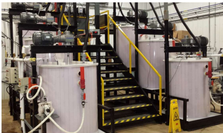
Search Water Leach Pilot Plant at SGS

Search has received notice from the Canadian Environmental Assessment Agency (“CEAA”) and from the Province of Newfoundland and Labrador (“Province”) for Search to provide an Environmental Impact Statement (“EIS”). Both CEAA and the Province have provided final guidelines required for the preparation of the EIS. In August 2018, both CEAA and the Province completed a site visit to Foxtrot and Deep Fox. Both agencies will work in concert to reduce duplication in the EIS process. The Company has initiated environmental baseline studies as defined in the guidelines. The environmental baseline studies will take place along with transparent and open communication with all stakeholders and interest groups in the submission of the EIS. This EIS preparation is another milestone in the development and permitting of the project.