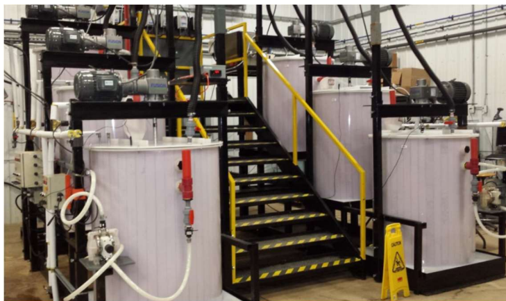
Search Water Leach Pilot Plant at SGS

Search has received notice from the Canadian Environmental Assessment Agency (“CEAA”) and from the Province of Newfoundland and Labrador (“Province”) for Search to provide an Environmental Impact Statement (“EIS”). Both CEAA and the Province have provided final guidelines required for the preparation of the EIS. In August 2018, both CEAA and the Province completed a site visit to Foxtrot and Deep Fox. Both agencies will work in concert to reduce duplication in the EIS process. The Company has initiated environmental baseline studies as defined in the guidelines. The environmental baseline studies will take place along with transparent and open communication with all stakeholders and interest groups in the submission of the EIS. This EIS preparation is another milestone in the development and permitting of the project.