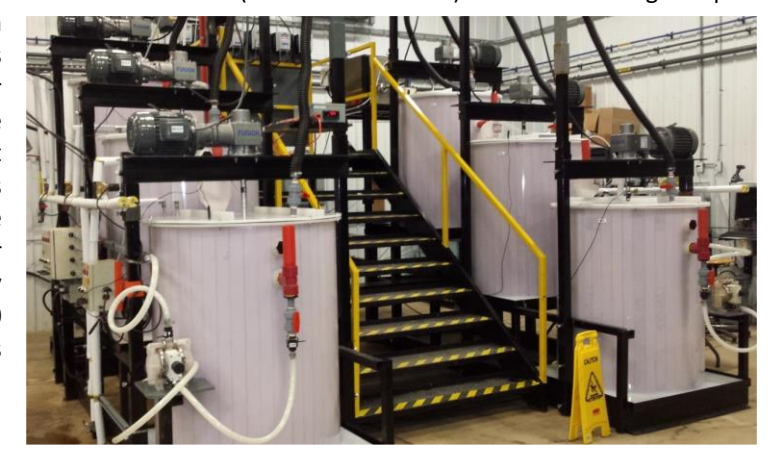
Search Water Leach Pilot Plant at SGS

facilities. The Company has been in continued discussion with various separation refineries whom have either tested the material or reviewed the technical information from the pilot plant. The funding of the pilot plant was provided by $750,000 from the Newfoundland and Labrador Department of Tourism, Culture, Industry and Innovation ("TCII") and $500,000 from the Atlantic Canada Opportunities Agency ("ACOA").