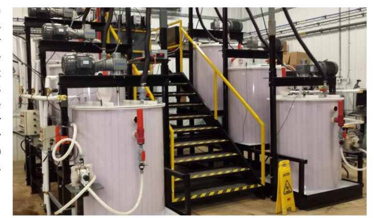
Search Water Leach Pilot Plant at SGS

facilities. The Company has been in continued discussion with various separation refineries whom have either tested the material or reviewed the technical information from the pilot plant. The funding of the pilot plant was provided by $750,000 from the Newfoundland and Labrador Department of Tourism, Culture, Industry and Innovation ("TCII") and $500,000 from the Atlantic Canada Opportunities Agency ("ACOA").